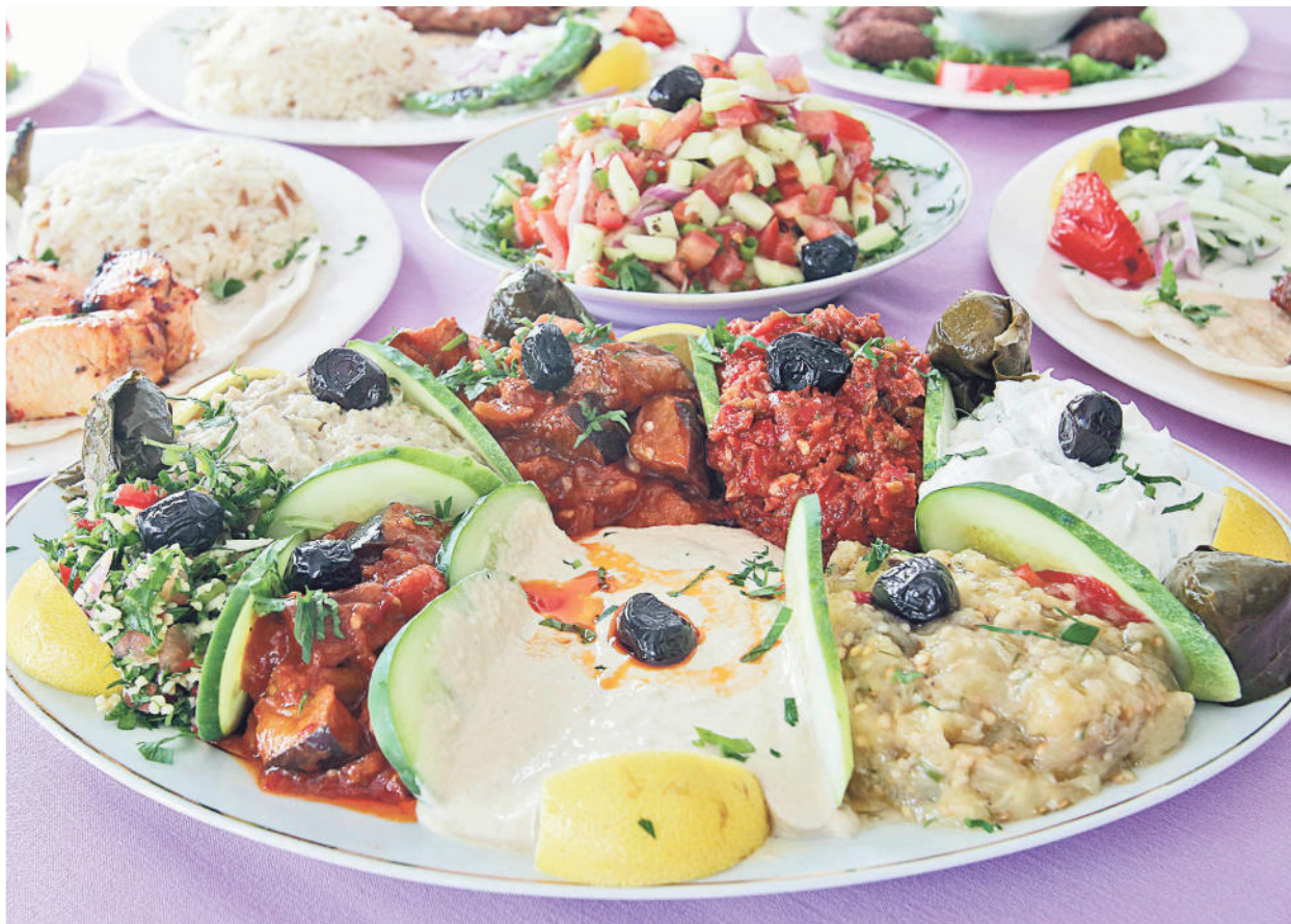
Cuisine served at the Mor Turkish Mediterranean Restaurant in Madison.