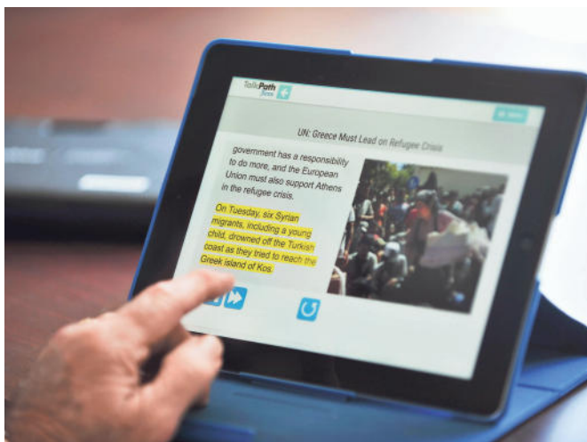
Lingraphics' TalkPath News software is designed to help those with aphasia.